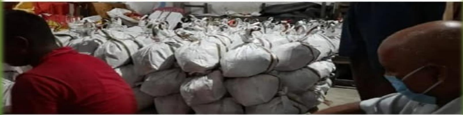
ত্রাণ বিতরণের প্রাক্কালে